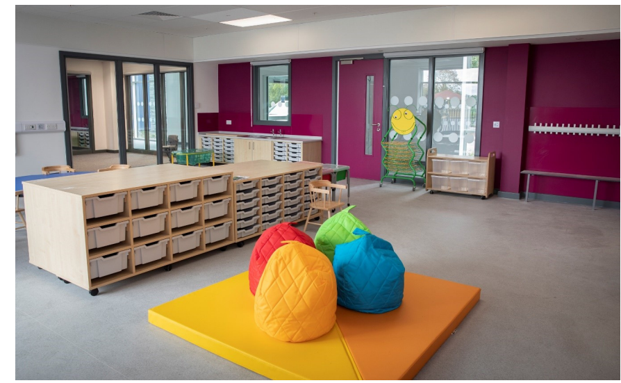
Early Contractor Involvement (ECI)

A two-stage tender process with Early Contractor Involvement enabled Read Construction to be appointed early in the design process. The Contractor has taken part in the design development and construction planning stage of the project and has offered advice on buildability issues and cost efficiencies which helps to minimise risk moving forward. Early Contractor Involvement is widely accepted to be beneficial and supports improved collaboration, innovation and planning.